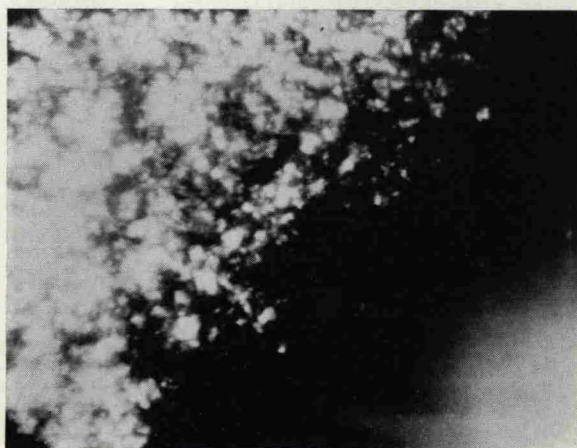
FIG. 6 Loss of transparency due to scattering from the transformed material in the interior of the crystal. Exposure time for Fig. 6 is considerably larger than for Figs. 3-5.

FIGS. 3-5. Progress of the transformation on the surface of the crystal.