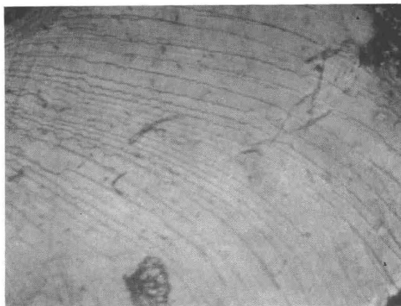
FIG. 2. Photograph of RbI crystal at a very early stage of its transformation to the high pressure phase. The near face of the crystal is in clear focus. Note the steps in the cleaved surface, the transformed "island" of surface on the back face of the crystal at the bottom of the photograph, and the island on the near surface at the upper right.